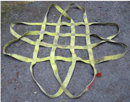
Rock Sling, Net/Basket style hand carry large boulders with 4-6 persons