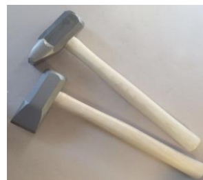
Stone Hammers with carbide tips