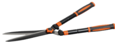
Brush Shears good for thick brush