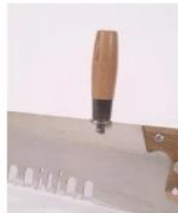
XC Handle, Supplemental (Auxiliary)