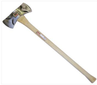
Double Bit Axe