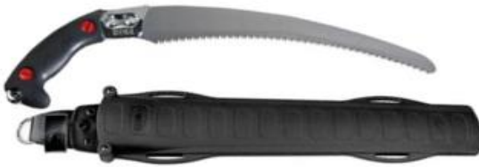
Silky Ibuki Saw