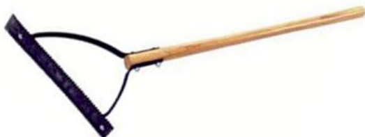
Weed Whip / Weed Cutter swing like a golf club for thick brush