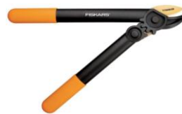
Short Loppers easier to pack