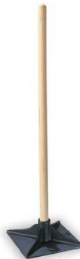
Tamping Tool compacting large areas