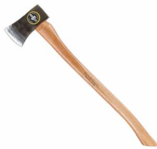
Single Bit Axe