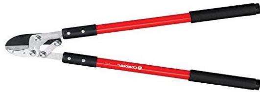
Loppers, anvil style good on dead limbs