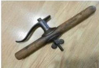
XC Handles, Western (West Coast)