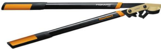
Loppers, geared mechanical advantage to make cutting easier