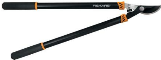
Loppers, bypass style for clean cuts on green or live growth