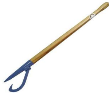
Peavey, Bangor style

leverage for moving logs easier to carry by removing hook