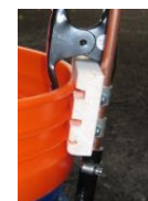
Outlet tube mount

weight of brass fitting on inlet end helps keep hose at bottom of bucket