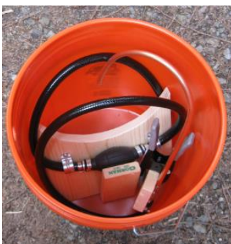
Foot pump assembly stores inside orange bucket (also soap, soap bin & small clamp)