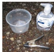
Foot pump assembly stores inside orange bucket (also soap, soap bin & small clamp)