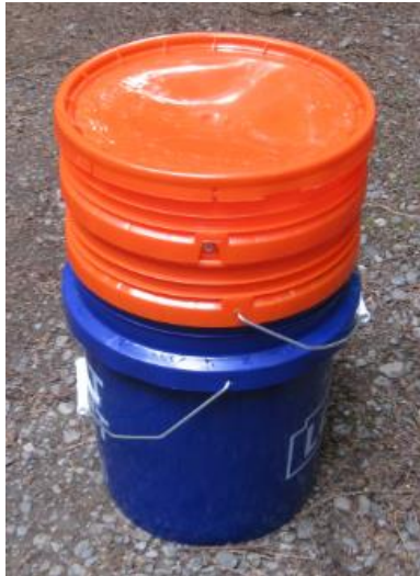
Hand wash station packed for transport & storage